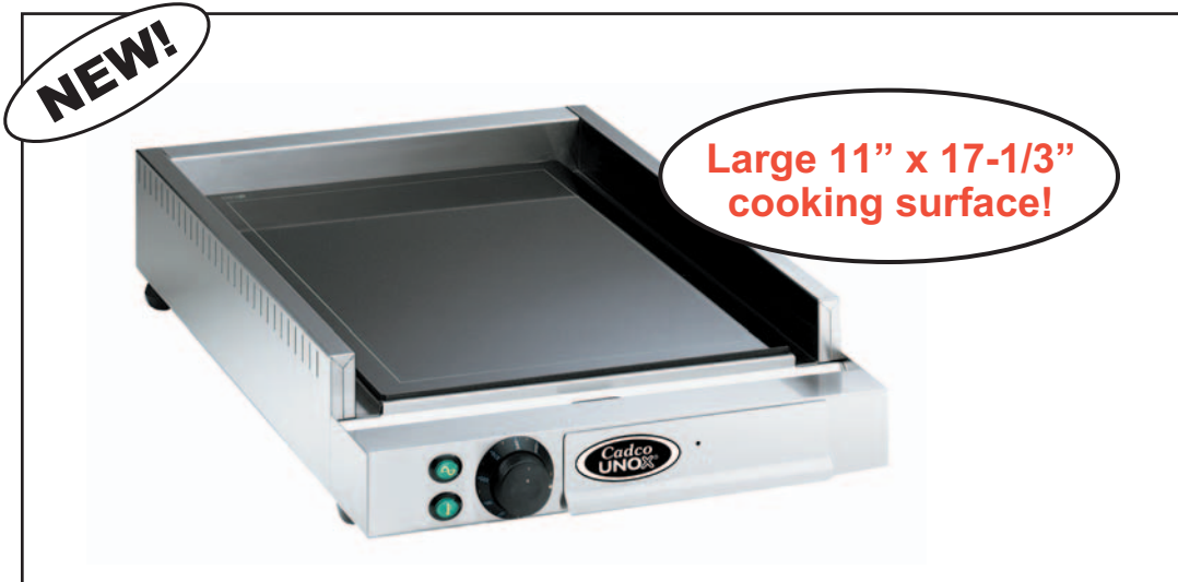
Model FTCG-200 - Glass-Ceramic Fry-Top Griddle